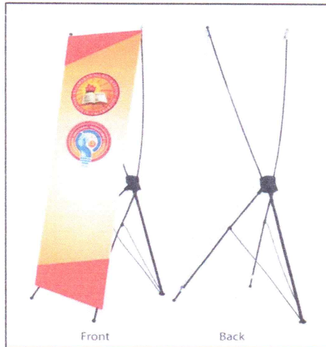
Prescribed Dimensions of the Tarpaulin: 2 ft. x 5 ft. with prescribed style of the Siuni

have a width and height of 2 ft. and 5 ft., respectively. For uniformity, below is the standard poster stand to be used.